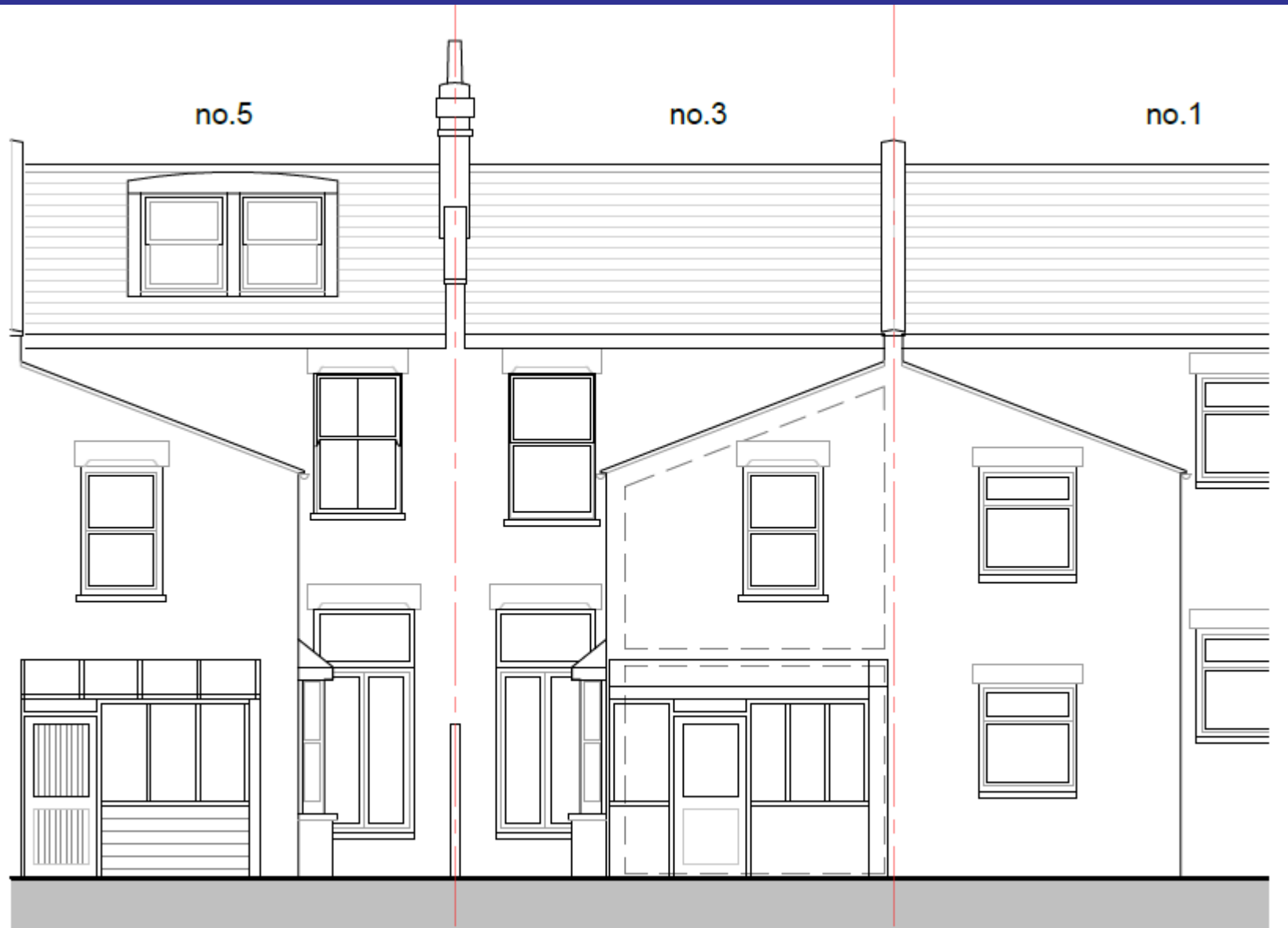
REAR ELEVATION - NORTH WEST (EXISTING)