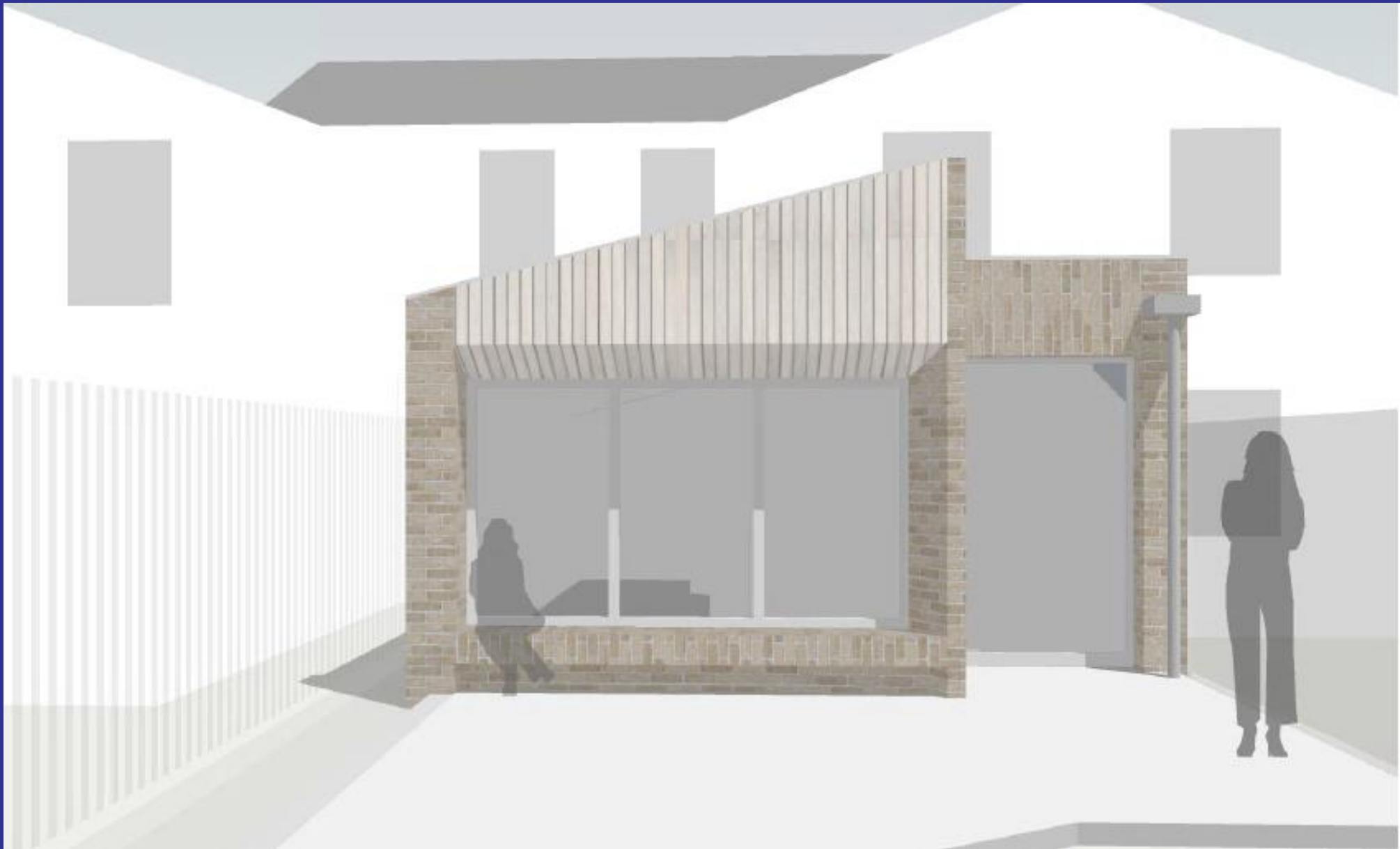
Rear 3D View